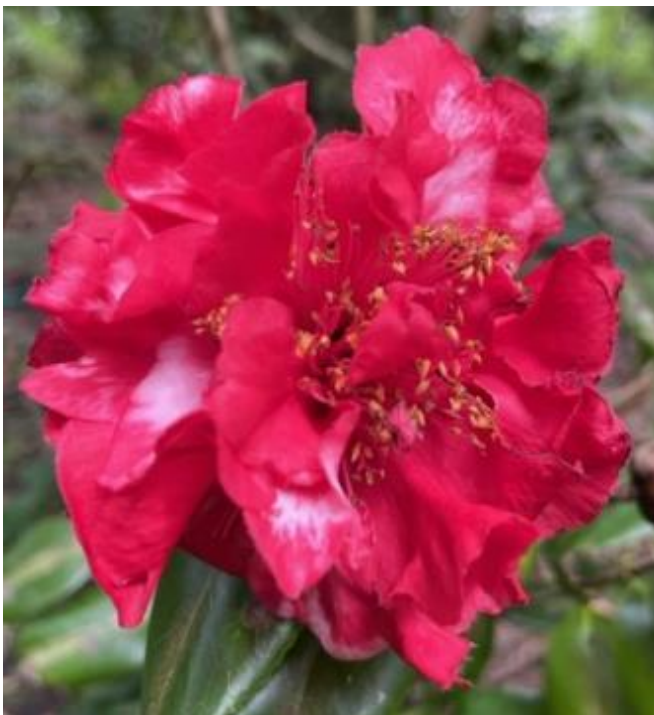
Edna Bass variegated