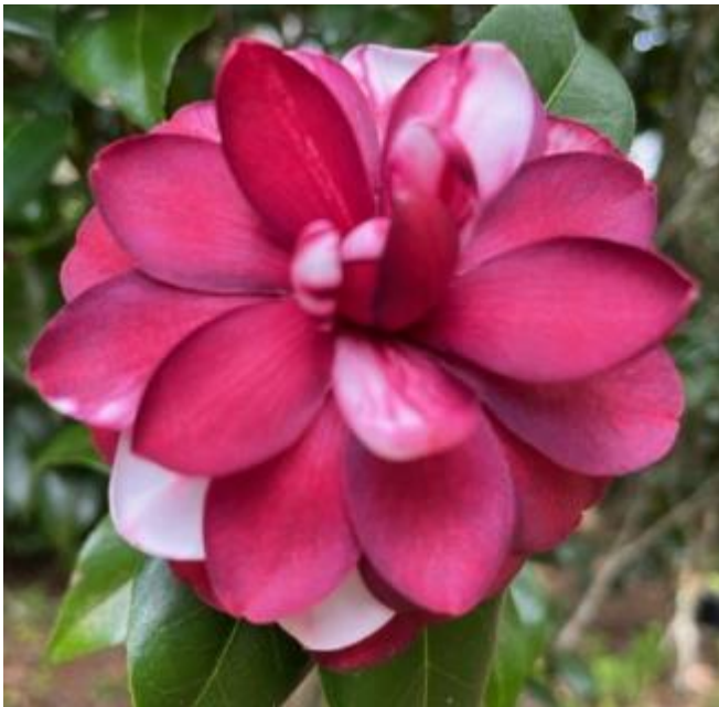
Tudor Baby var.

Camellia season is rapidly descending upon us, with Georgia National Fair on Saturday, October 15 th , followed by the Wiregrass Show in Boston, Georgia, on November 4 th . They are both an easy two hours away if you wish to attend.