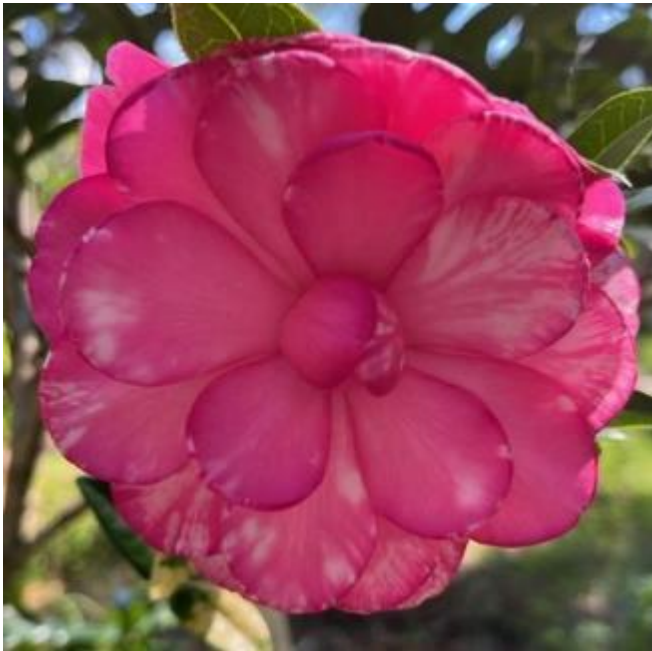
Debbie Ellis var.

Camellia season is upon us. Bountiful rain has given us many large buds to disbud. In doing so it gives you larger blooms. Late season fertilization with 16-4-8, CyberCoat slow release or Milorganite will provide nutritional needs throughout the blooming season.