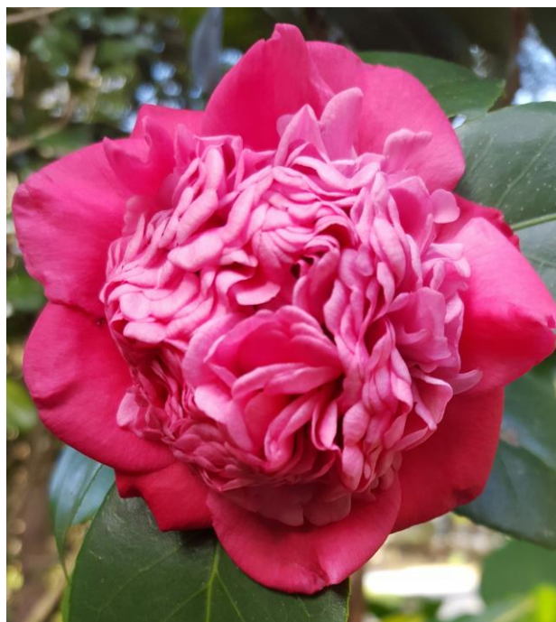
Prof. Charles S. Sargent

A motion was made and passed to accept the December minutes and Treasurer's report.