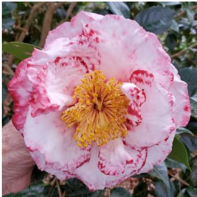
Terry Gilley var.