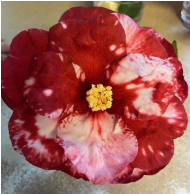
Royal Velvet variegated